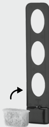
Coffeemaker Charcoal Water Filter and Holder

NOTE: We recommend changing the water filter every 60 days or after 60 uses, and more often if you have hard water. Replacement filters can be purchased in stores, or by calling Cuisinart Consumer Service, or at www.cuisinart.com .